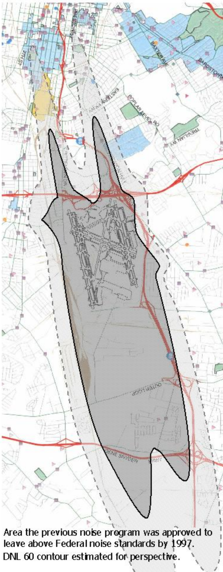
Area the previous noise program was approved to leave above Federal noise standards by 1997. DNL 60 contour estimated for perspective.